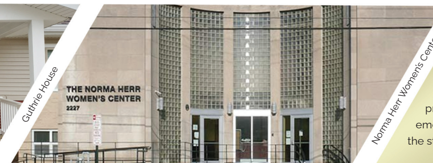
Norma Herr Women's Center