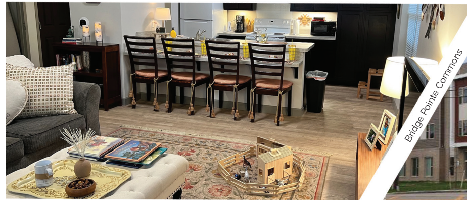
Bridge Pointe Commons